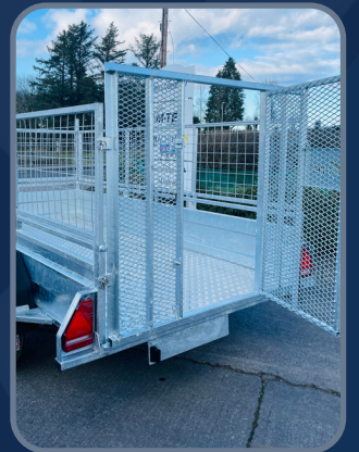
Sheep door in rear door