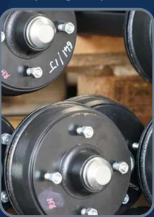
Knott brakes and axles

The M-TEC twin axle range are the perfect trailer for those looking to invest in a long lasting, strong, high quality trailer. M-TEC trailers have been designed and built to withstand the rigorous demands required from your trailer. Spring leaf suspension prevents excess motion of the trailer. With LED lighting and galavanised body the M-TEC trailers are not only eye catching but robust.