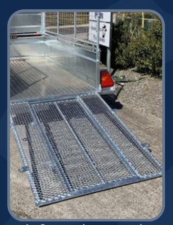
Reinforced ramp door