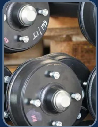
Knott brakes and axles

The M-TEC twin axle range are the perfect trailer for those looking to invest in a long lasting, strong, high quality trailer. M-TEC trailers have been designed and built to withstand the rigorous demands required from your trailer. Spring leaf suspension prevents excess motion of the trailer. With LED lighting and galvanised body the M-TEC trailers are not only eye catching but robust.