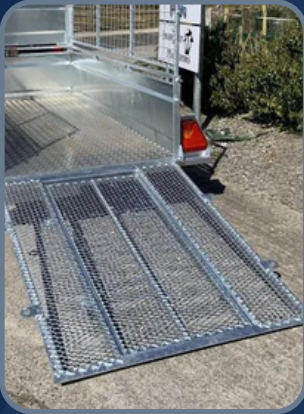
Reinforced ramp door