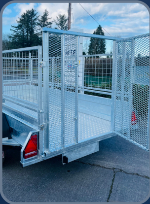
Sheep door in rear door