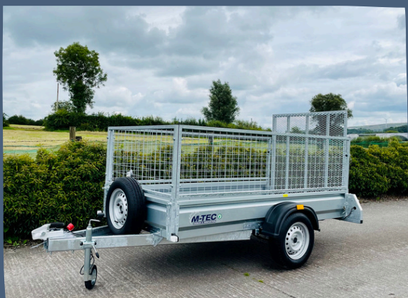
8FT x 4FT