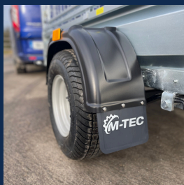
On/Off Road Tyre