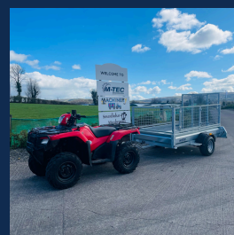
Dual use. Quad can tow or be towed